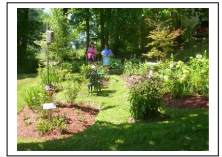
Guests touring the garden during the Garden Tour in August.

After the past several hard winters it was determined that we should purchase a new snow-blower to replace the old one that needed yearly repairs to keep it going. Stone dust was purchase to repair the back driveway that had worn down and was causing cars to get stuck. On an ongoing basis perennial plants were divided and moved in the gardens in preparation for the August garden tour.