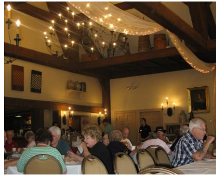
Publick House Dinner

June: The Tavern sponsored a well-attended Publick House Italian Buffet as a fundraising effort. There was a great