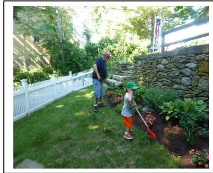
The caretaker's grandson helps in a garden.

These gardens, which I maintain and am quite proud of include over 75 varieties of plants. Next summer if you are in the area feel free to stop by and check them out.