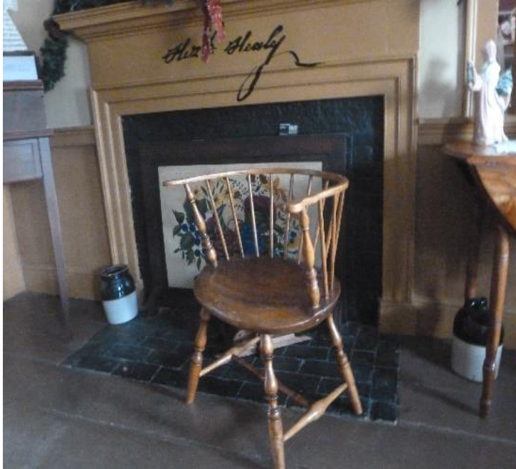
The chair in its place of honor at the Tavern.