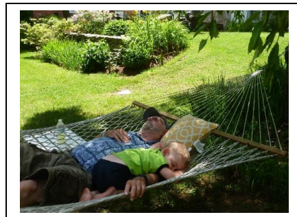
Time for the gardeners to rest.

Besides working in the gardens, spring means the annual raking, reseeding, aerating, liming and fertilizing the lawns.