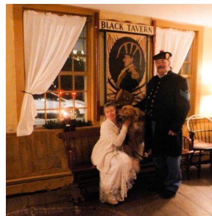
A Civil War Christmas Wedding Reception Took Place At The Tavern in December