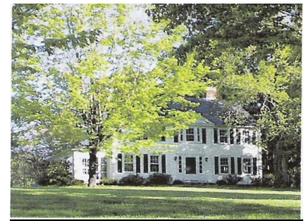
The President's House