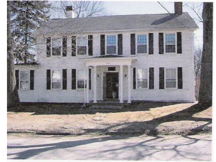
The 1805 House